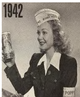
Jane Wyman 1942

On the Department and Malta has great ideas for you. Report it as well.