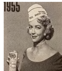
Dorothy Malone 1955

V.F.W. Hollywood Stars. Here is a page for Winter Conference "Buddy"® Poppy. Judging