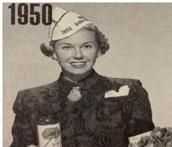
Doris Day 1950