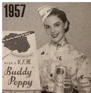
Natalie Wood 1957