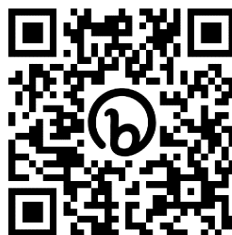
VFW National Home Store